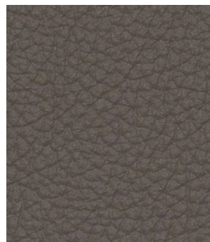
Tennant Plus Taupe