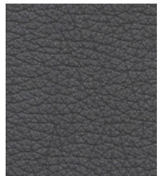
Tennant Plus Storm