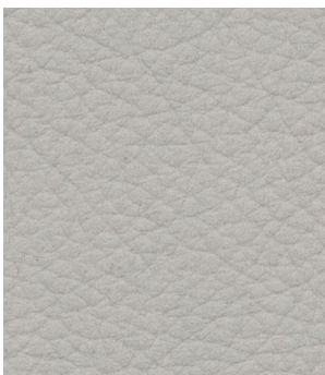
Tennant Plus Cloud