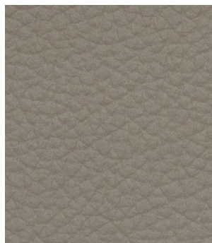
Tennant Plus Biscuit