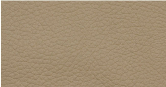
Tennant Plus Cappuccino