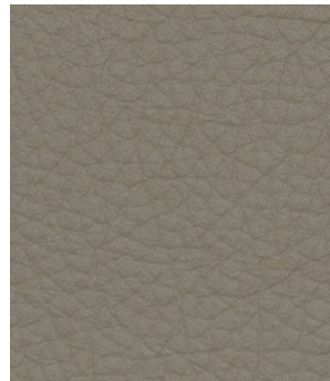
Tennant Plus Hemp