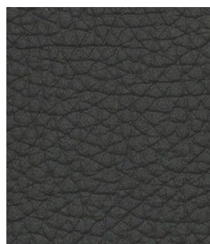
Tennant Plus Charcoal