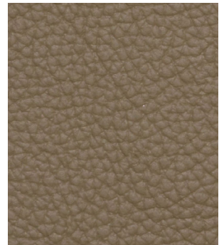
Tennant Plus Sandstone