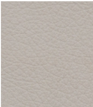
Tennant Plus Linen