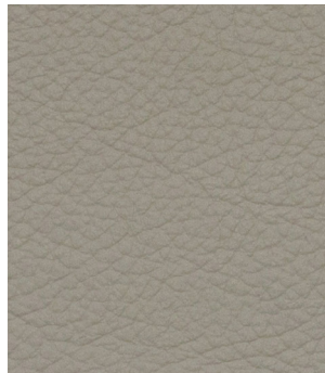
Tennant Plus Limestone