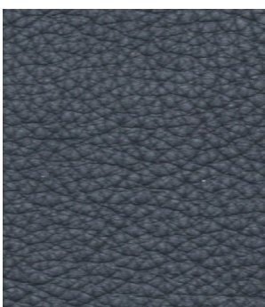
Tennant Plus Blueberry