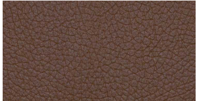
Tennant Plus Oak