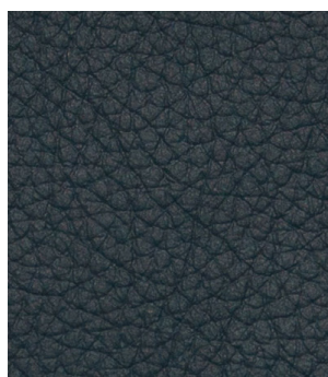
Tennant Plus Marine