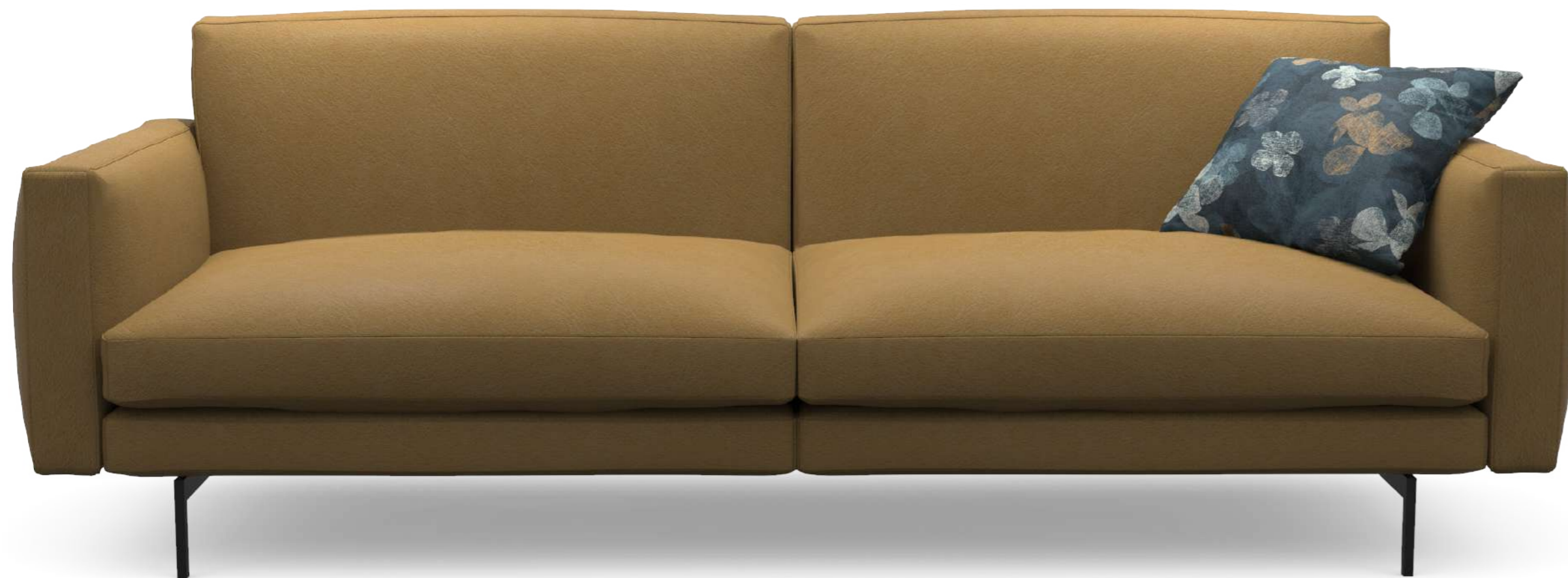
Couch covered in MARLO DIJON